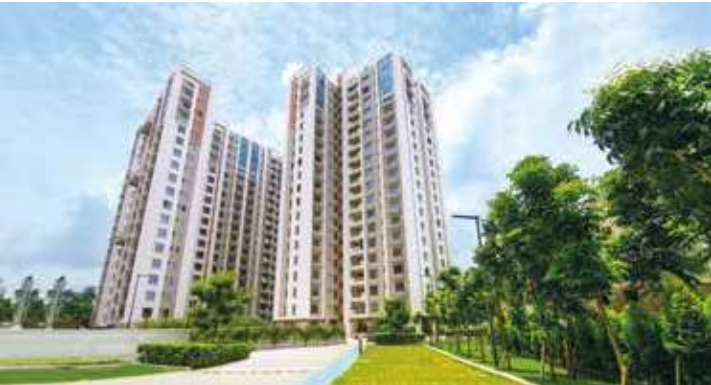
OZONE on South EM Bypass