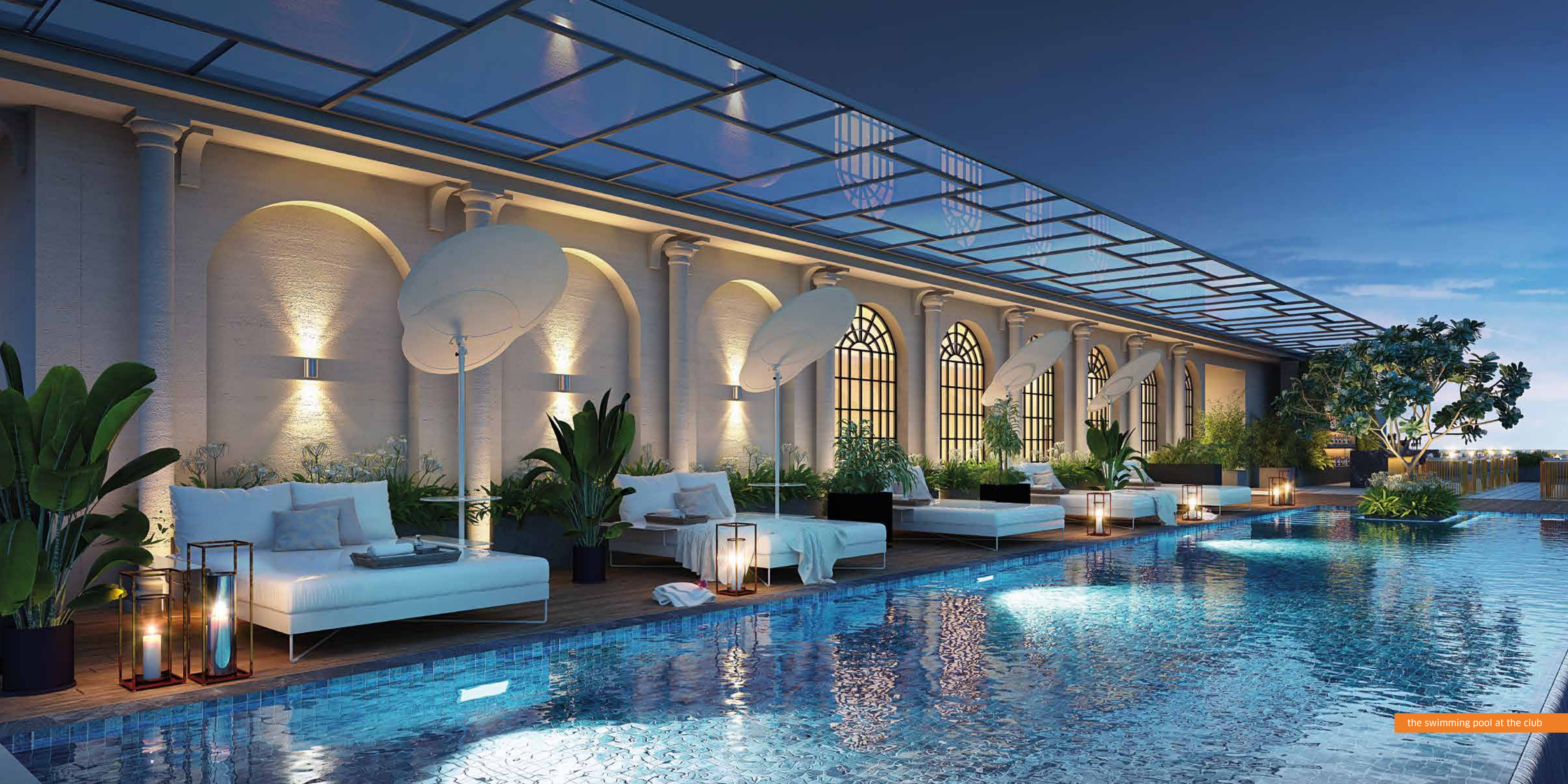
the swimming pool at the club