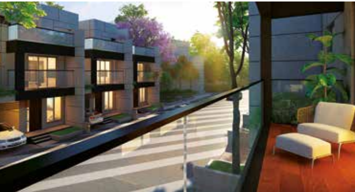
BOTANICA bungalows near Southern Bypass