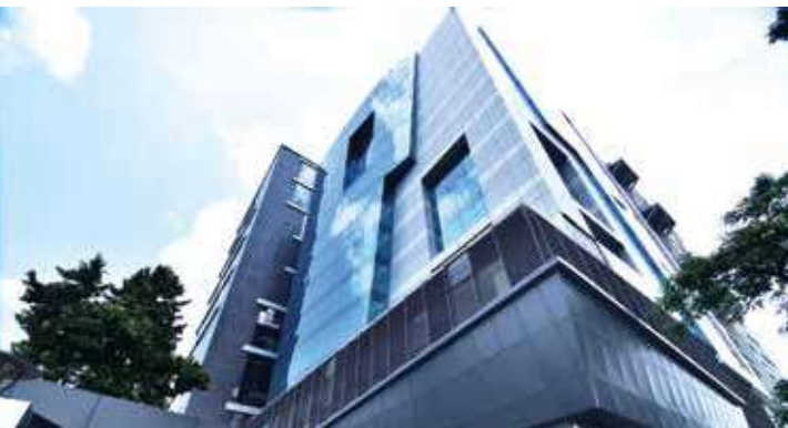
SRIJAN TECH PARK Sector V Salt Lake