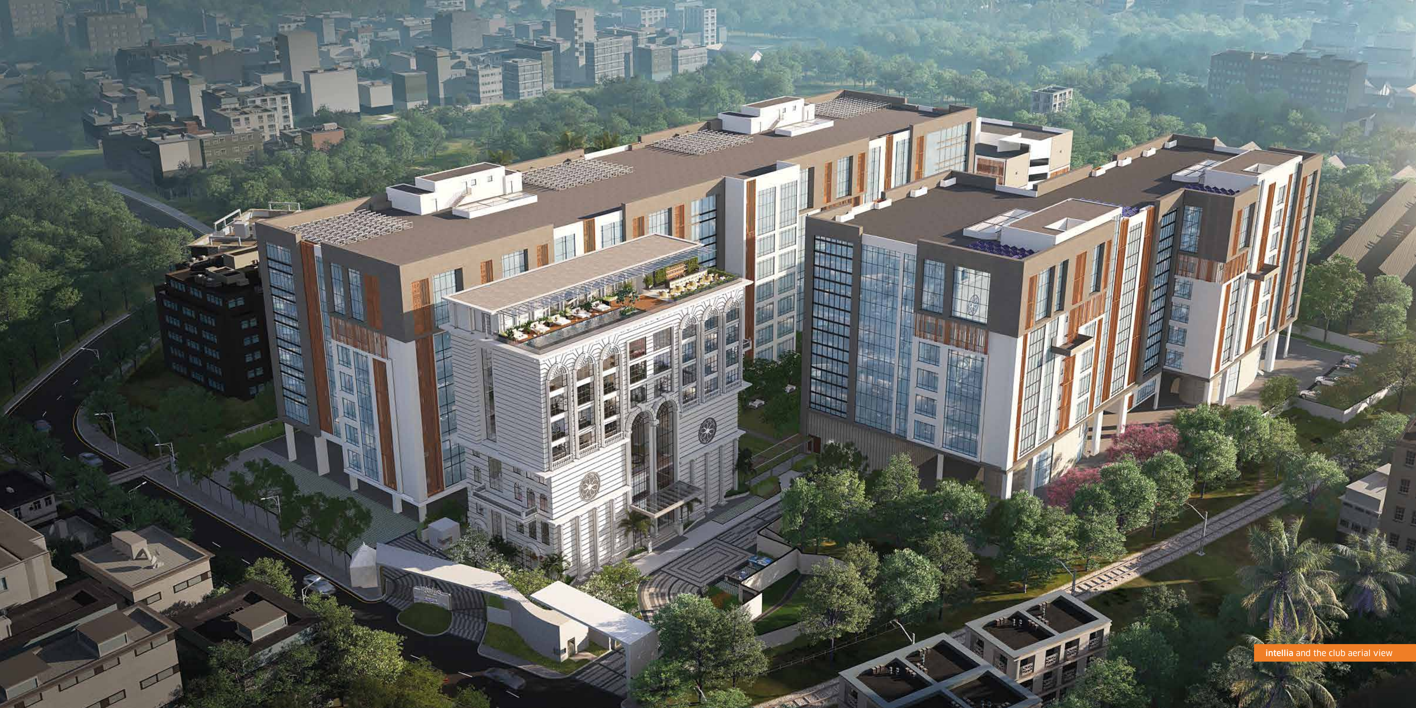
intellia and the club aerial view