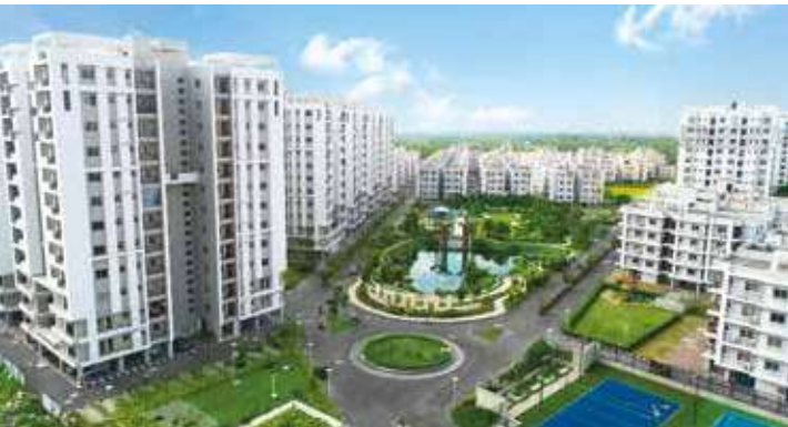
GREENFIELD CITY near Behala Chowrasta Metro