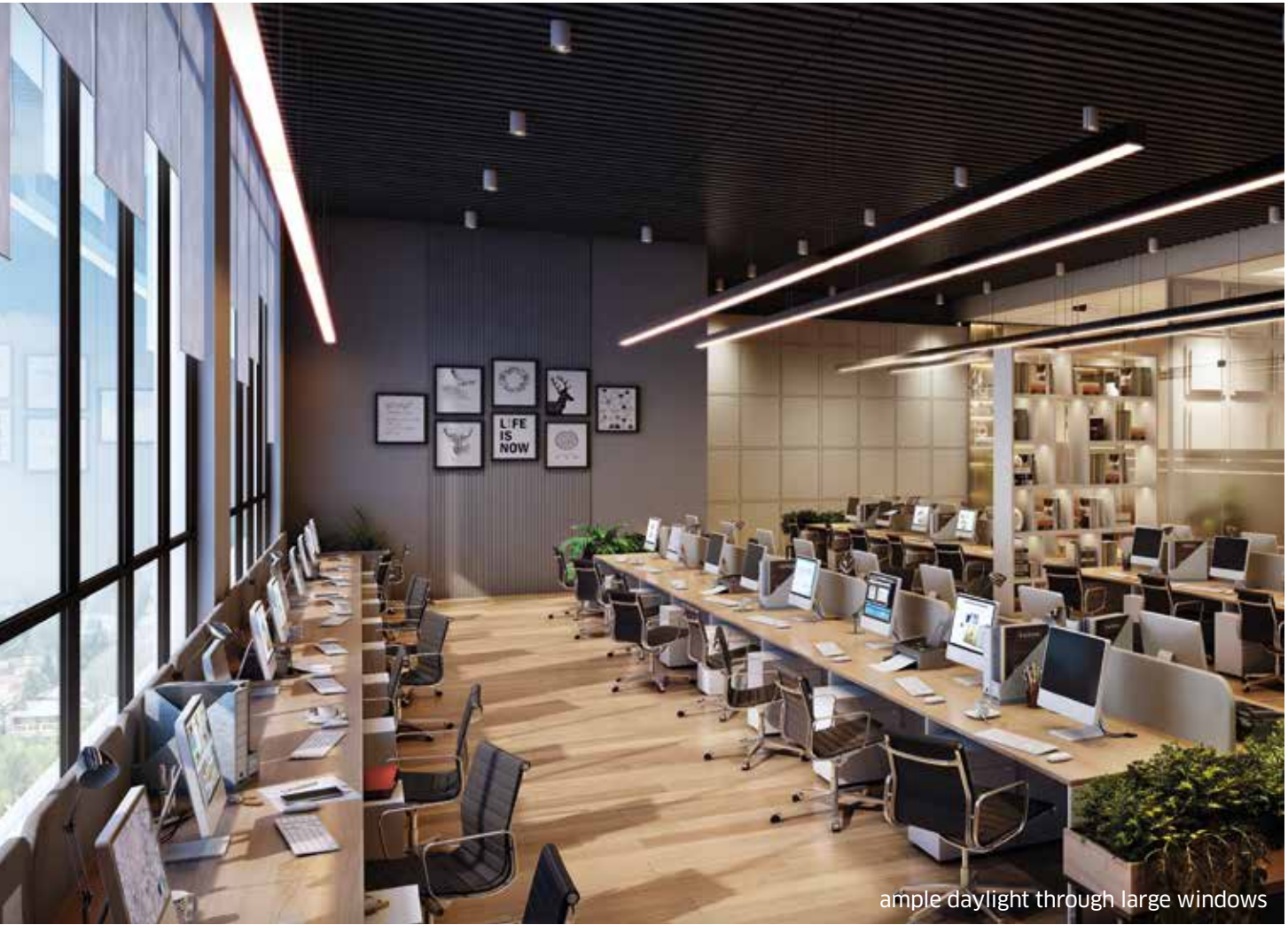
ample daylight through large windows