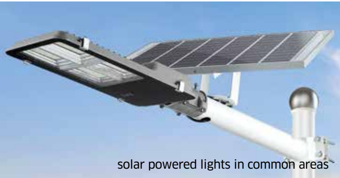
solar powered lights in common areas