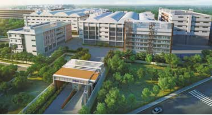
SRIJAN INDUSTRIAL LOGISTIC PARK on NH 6