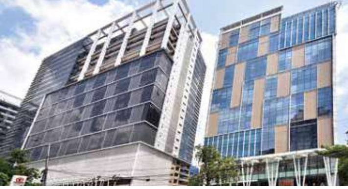
SRIJAN CORPORATE PARK Sector V Salt Lake

Srijan Realty Private Limited is one of the leading real estate companies of eastern India with its presence in Kolkata and Asansol as well as Chennai in the south. The company has leveraged its rich insight into consumer preferences with customised property development.