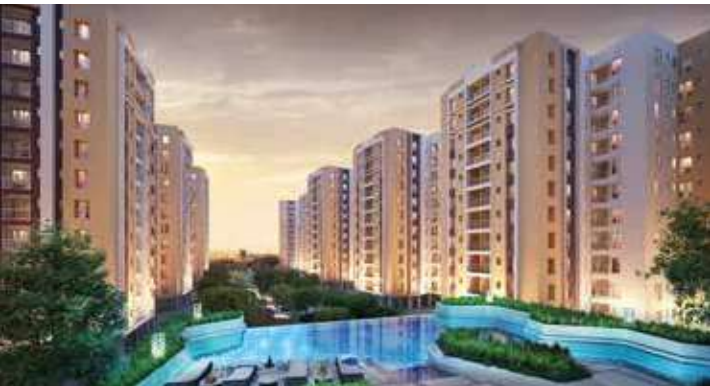
ETERNIS on Jessore Road