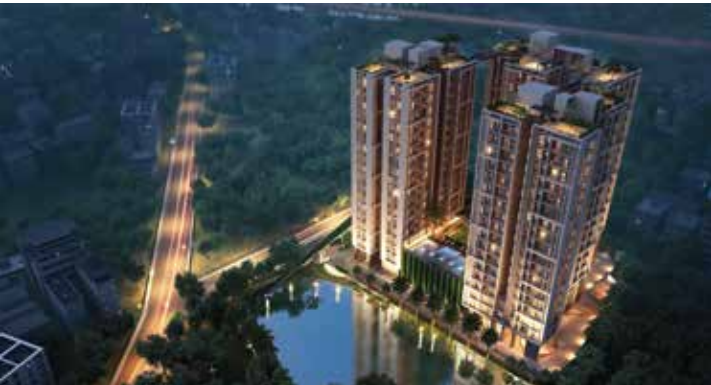
LAGUNA BAY near Science City