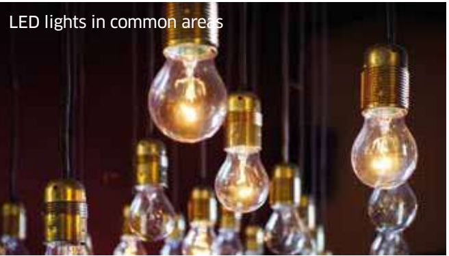
LED lights in common areas

intellia will have windows that are adequately sized to allow a lot of daylight and fresh air. Better indoor environmental quality will protect health, improve the quality of life, and reduce stress. In a way, it will also escalate the the resale value of the property.