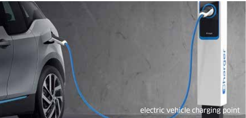
electric vehicle charging point

With rising fuel prices there is and will be a propensity to shift to renewable resources for vehicles. Which is why, the usage of electric vehicles are on the rise. A platinum rated property will have to have electric vehicle charging points to provide occupants the provisions to charge electric vehicles at an extra cost.